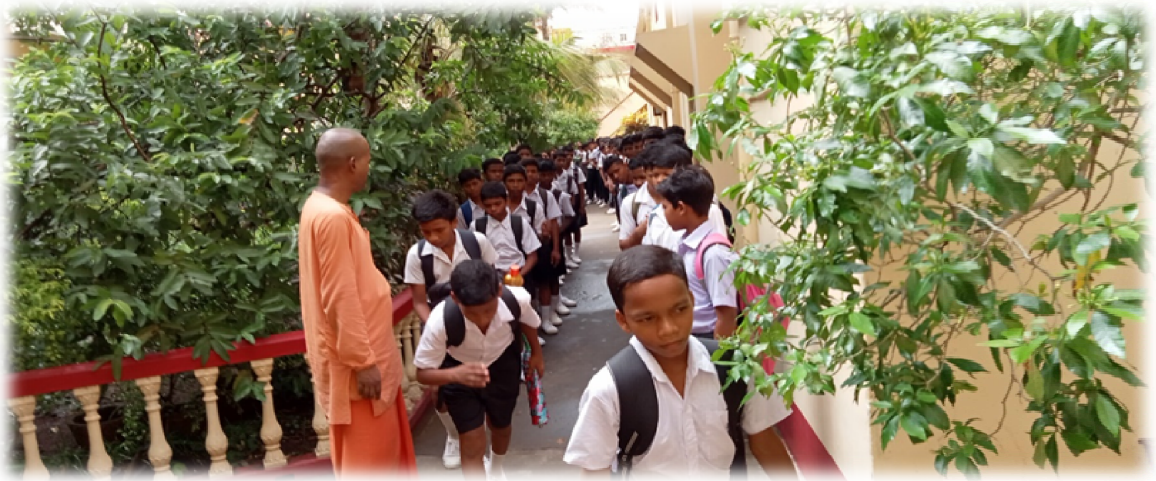
Students are on the way to school

Application are invited (in the prescribed format) from the deserving poor and meritorious students of tribal communities from different tribal districts of Odisha. These students are selected on the basis of poverty through entrance examination both written and oral testimony. The subjects of the written tests are i) FLO (Odia), ii) SLE (English) and iii) Mathematics. The selected students are admitted into the nearby Govt. High School (6 minutes' walk-able distance from the hostel)