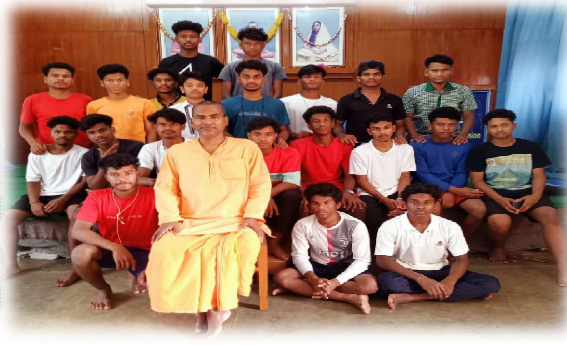
PASSED OUT STUDENTS 2023-24

DDG from Ministry of Tribal Affairs, NGO Division interacted with the hostel students during his visit on 23 March 2024