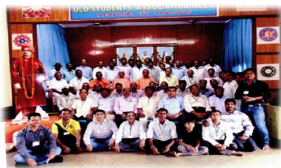
RKM OLD STUDENTS ASSOCIATION, PURI